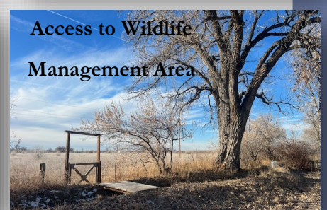
Access to Wildlife Management Area